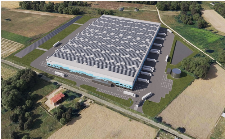
Photo of the property Mszczonów

LCube has a valid building permit and is the owner of the land.