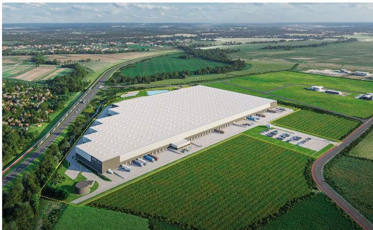
Photo of the property Wrocław East

Hillwood & LCube Wrocław East is situated in Dobrzykowice, which is located 13 kilometers east of Wrocław.