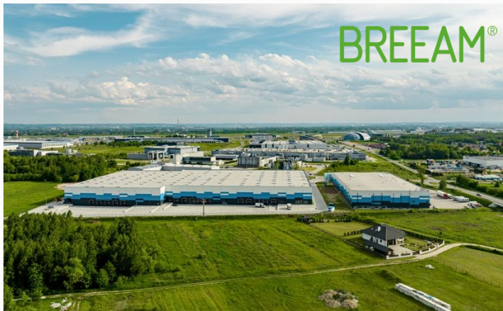
Photo of the property Rzeszów Airport

Both the interior and exterior of the buildings have been outfitted with energy-efficient LED lighting, and the facilities have been designed in accordance with BREEM very good certification criteria.