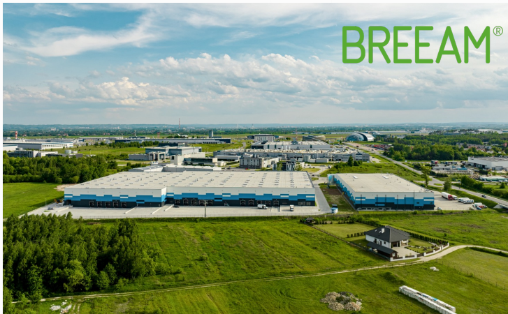
Photo of the property Rzeszów Airport

Both the interior and exterior of the buildings have been outfitted with energy-efficient LED lighting, and the facilities have been designed in accordance with BREEM very good certification criteria.