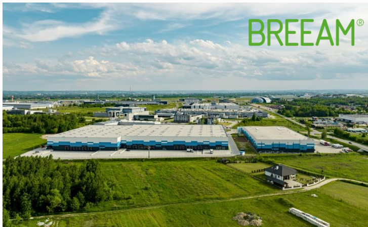
Photo of the property Rzeszów Airport

Both the interior and exterior of the buildings have been outfitted with energy-efficient LED lighting, and the facilities have been designed in accordance with BREEAM very good certification criteria.